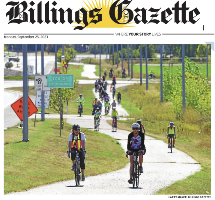
TRANSPORTATION TRENDS SHIFTING

Over the past year, the <u>DPHHS Asthma Control Program has</u> been able to provide over 11,000 air filters to schools. These filters provide for spaces in our school where air is clean, especially for students and staff with respiratory difficulties, during wildfire smoke seasons. They cannot purify entire schools but they are of great benefit. THANK YOU, DPHHS!