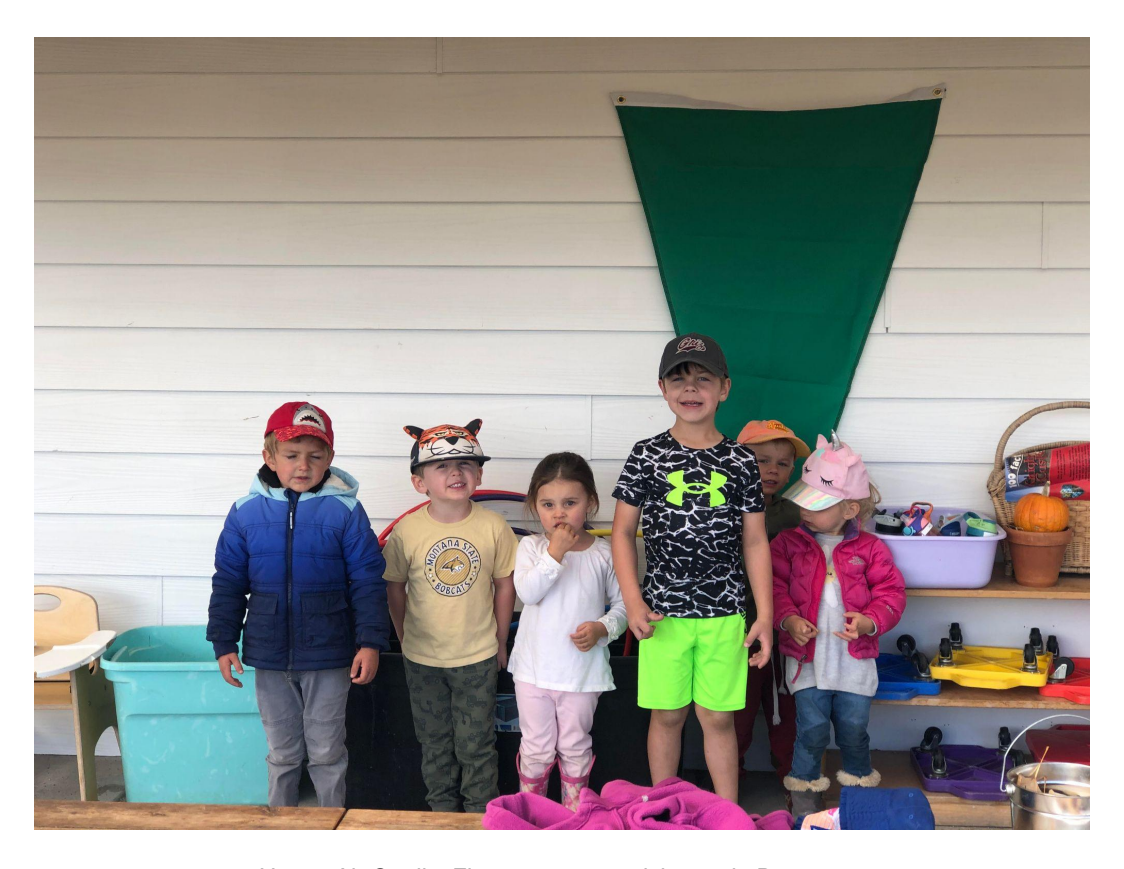
Happy Air Quality Flag program participants in Bozeman.