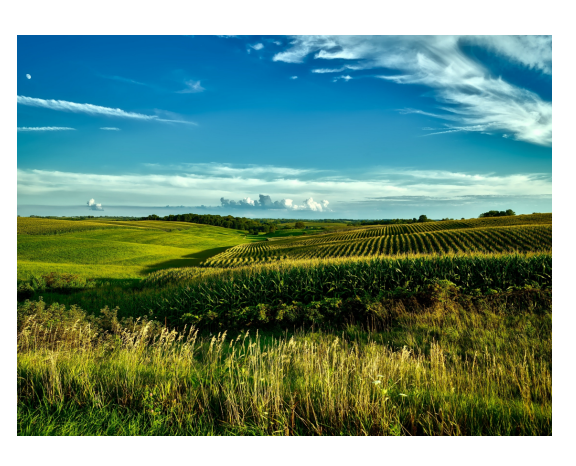
Our personal strength

In the meantime, celebrate our outdoors on your own/with your family this month as we all live like pioneers, rather isolated on the plains and in the mountains. Be grateful that we are allowed outside while many others in the world are not.